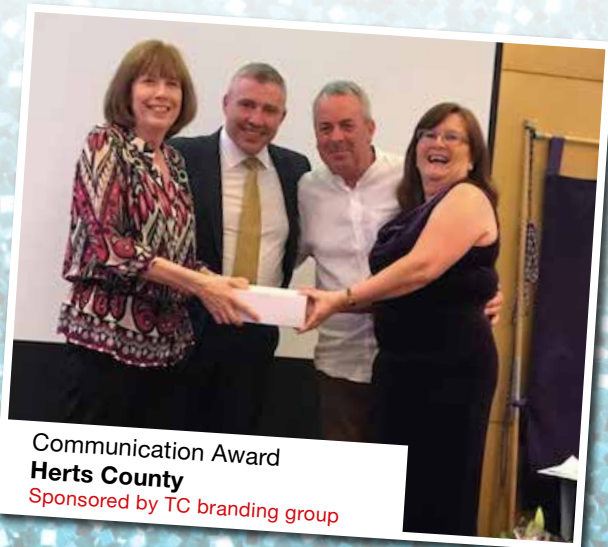
Communication Award Herts County Sponsored by TC branding group