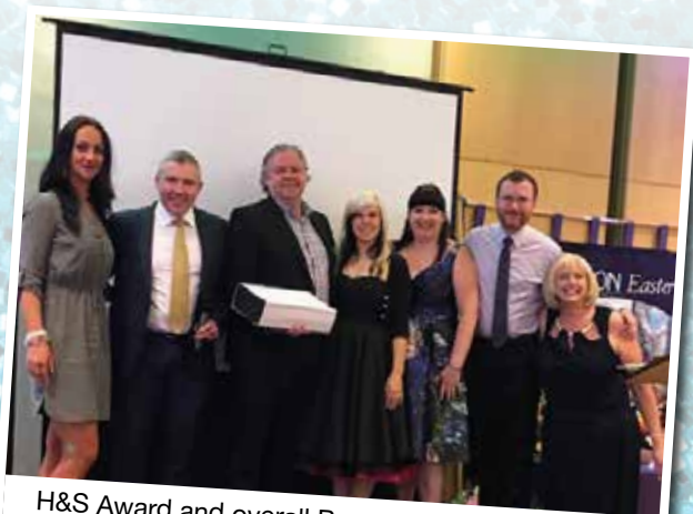
H&S Award and overall Branch of the Year Award Suffolk Police

Sponsored by Thompsons Solicitors and UIA