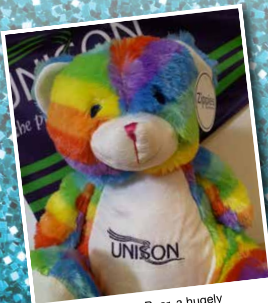
Eric the Rainbow Bear, a hugely popular mascot for ONE UNISON 2018