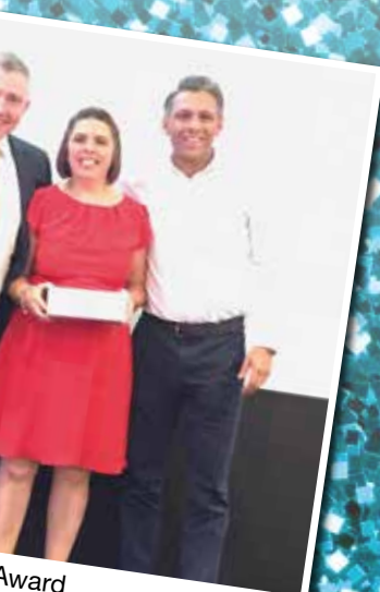
Award Anglia Hospitals NHS UNISON Protect

Sponsored by Thompsons Solicitors and UIA