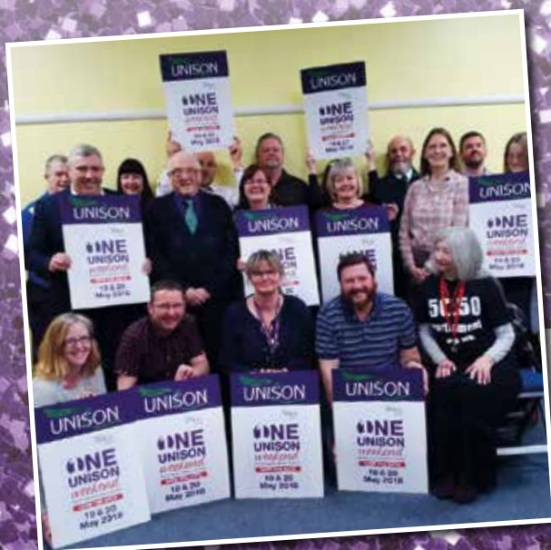
Regional Council showing its support for our ONE UNISON events