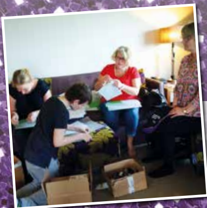
UNISON Regional Education & Training Committee members and staff getting delegate packs ready