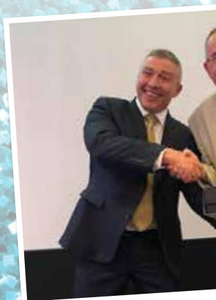
Learning Award West Suffolk Local Go Sponsored by UNISON's C