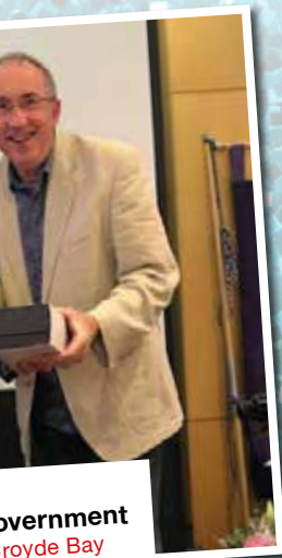
Government royde Bay