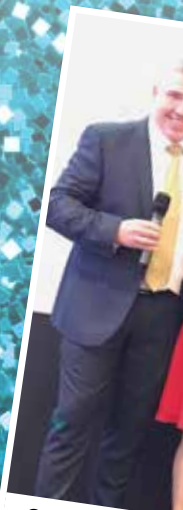
Campaigning A North West An Sponsored by UN